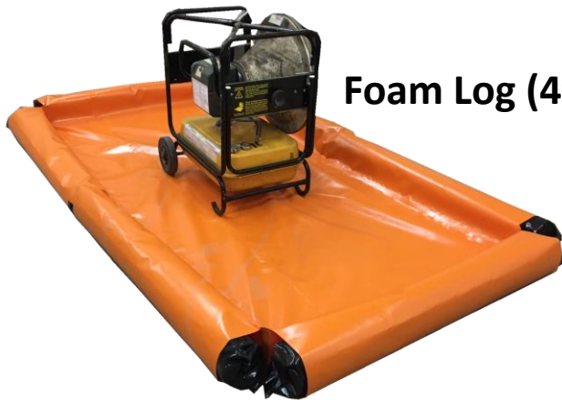
Foam Log (4'x8'x6")